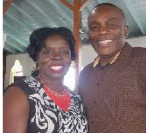
The M.P. and a constituent share a light moment during worship at Palm Sunday Prayers

The M.P. and staff at the Office of the M.P. express their gratitude for the support and patience exercised by the residents of the Tunapuna constituency as we strive to deliver in a timely manner the goods and services sought by our burgesses to enhance their development and daily lives. We urge you to rally with us as we strive for excellence and endeavor to enrich the livelihood of all constituents and citizens.