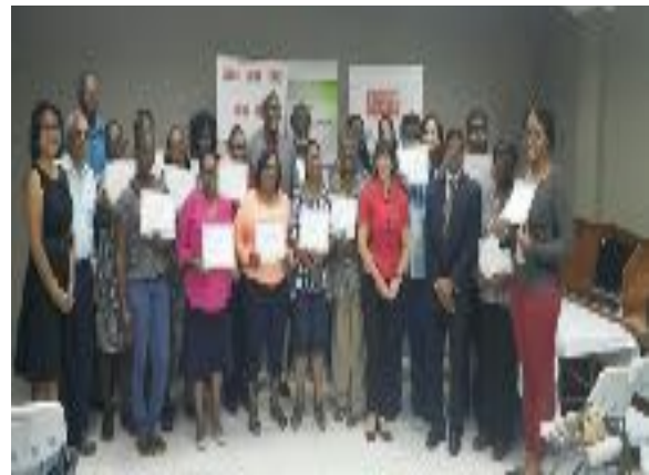
Participants in the WAND programme joyfully receive and proudly display their certificates.